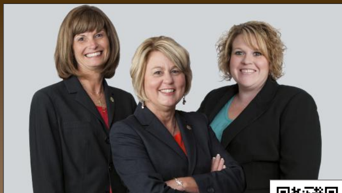
Our Treasury Management Team